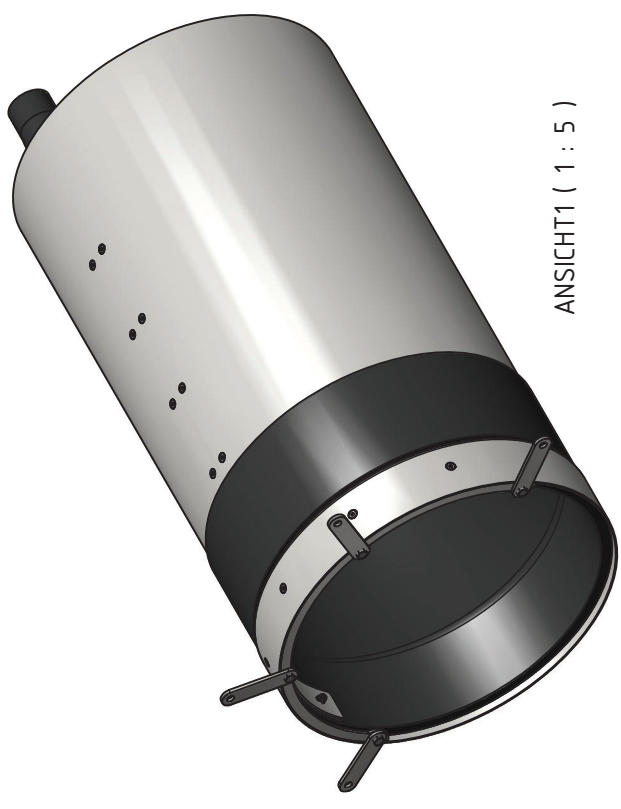
ANSICHT1 ( 1 : 5 )