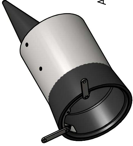
ANSICHT1 ( 1 : 5 )

Diese Zeichnung, sowie das Layout und die Inhalte sind Eigentum der Firma MTA Waterproducts GmbH und dürfen ohne ausdrückliche schriftliche Zustimmung der MTA Waterproducts GmbH weder in irgendeiner Weise kopiert, noch in irgendeiner Weise veröffentlicht werden. The drawings, layout and contents are the property of MTA Waterproducts GmbH and may not be copied, reproduced or published without the written consent of MTA Waterproducts GmbH.